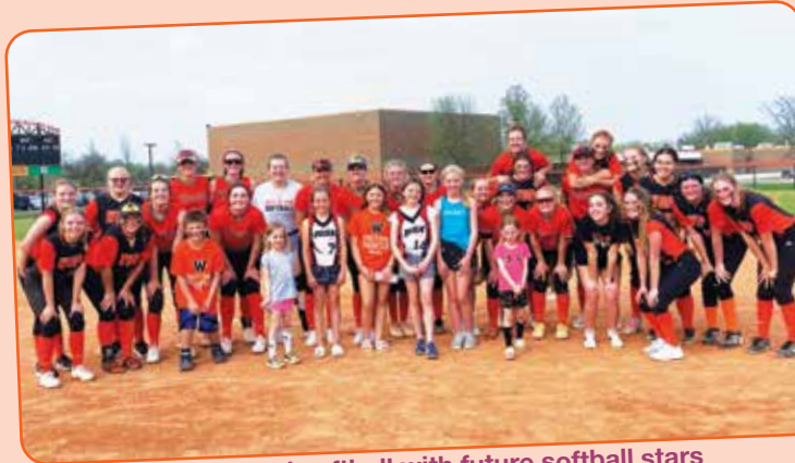
High School softball with future softball stars

A Vision of Pride and Excellence HOME OF THE PHANTOMS