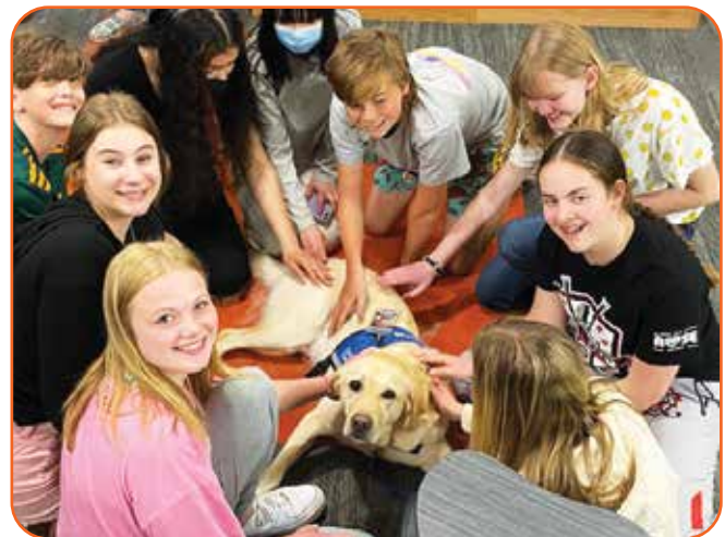
Middle School Hope Squad