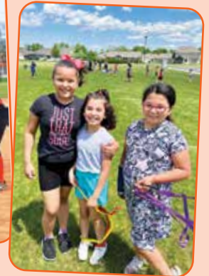
Field Day at Hemlock Creek