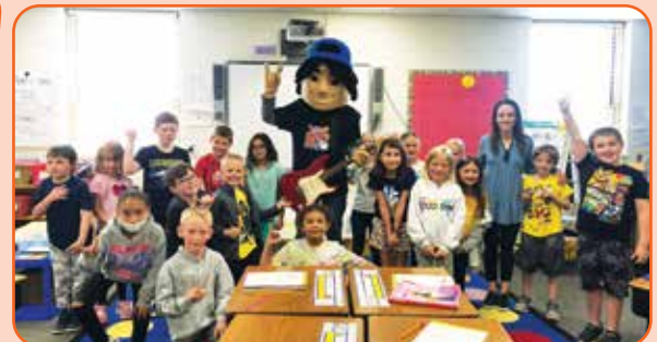
Westwood gets a visit from the Rockers baseball team mascot