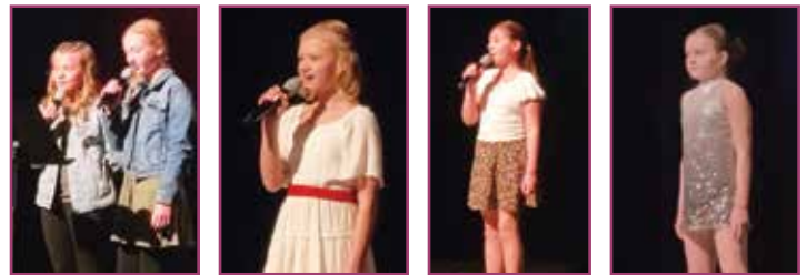
Intermediate/Middle School Talent Show