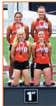
4x400 Relay State Champs