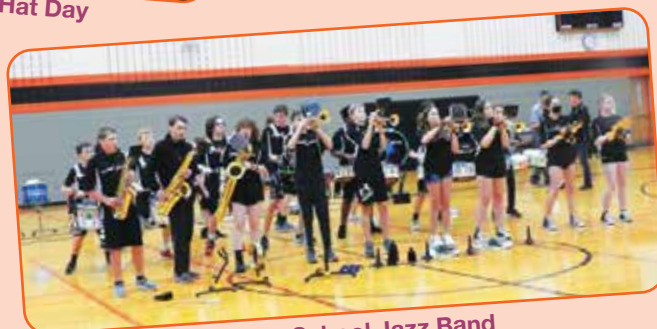
Middle School Jazz Band