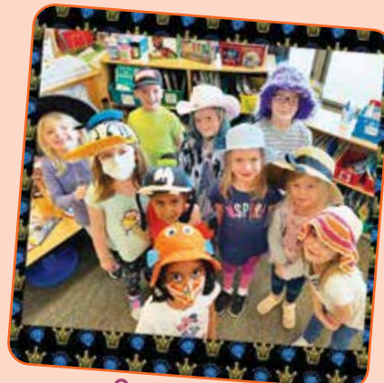
Crazy Hat Day