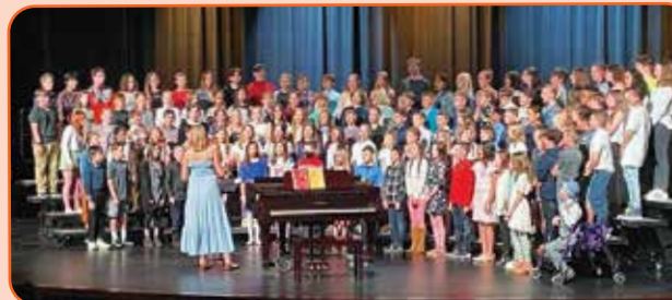
5th and 6th Grade Choir Concert