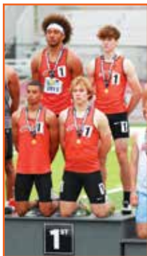
4 x 400 State Champs (Boys)